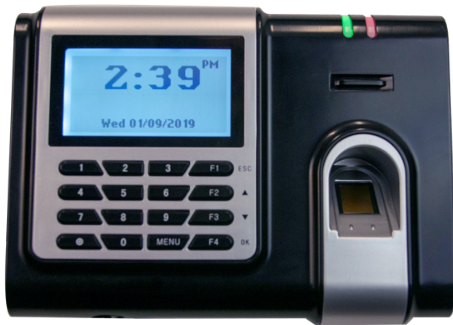
IDpunch 7 Finger Reader

The IDpunch 7 models are easy to use, low-cost time clocks for recording employee In and Out punches and other advanced time and attendance information. With the IDpunch 7, Attendance on Demand provides an inexpensive time clock framework that is enhanced with tested, proven, and proprietary internal programming.