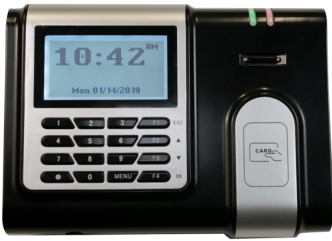
IDpunch 7 Proximity Reader